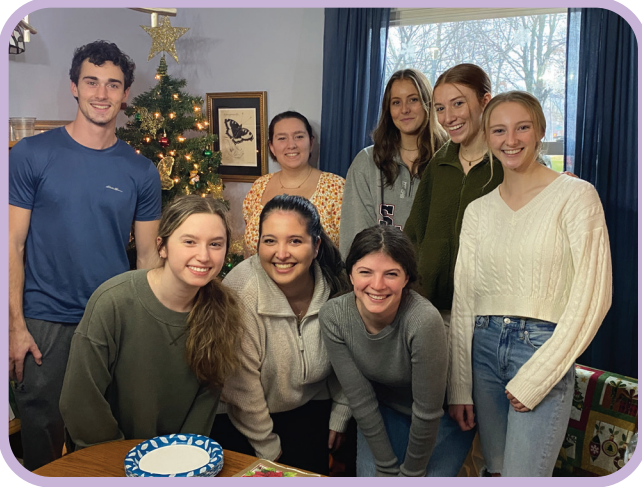
St. John Fisher Nursing Students earning hours at JH. They donated and decorated a new Christmas tree.