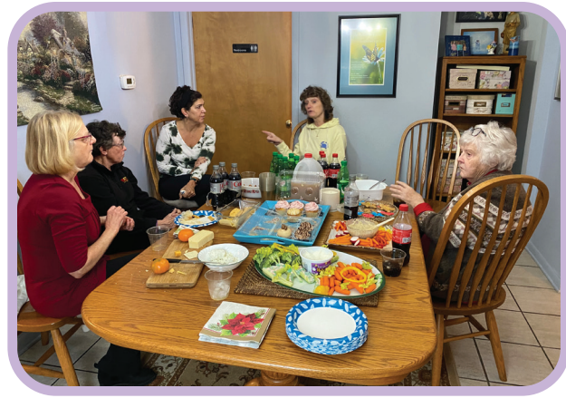
Some of our nurses enjoying snack time!