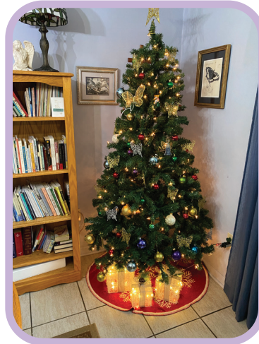
Our new beautiful Christmas tree!